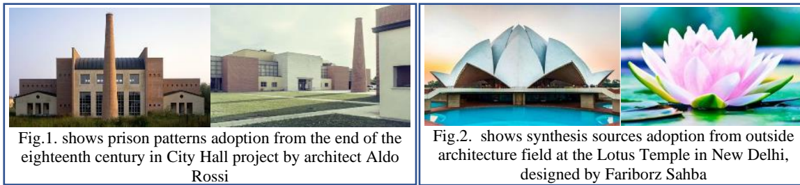
Fig.1. shows prison patterns adoption from the end of the eighteenth century in City Hall project by architect Aldo Rossi

painting, and basic organization of paintings, in addition to philosophy and economics.