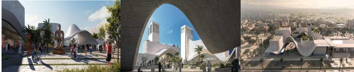
Fig.10. shows synthesis formulas at Barjeel Center for Modern Arab Art in Sharjah designed by Cell Studio, United Arab Emirates, 2019.

project ( https://tamayouz-award.com/ ). Tamayouz Award judges say that this project represents an original and exciting design that blends history and contemporary and addresses the blending of many other issues such as local and global, traditional and contemporary while linking the past to the future in addition to present an idea that clearly shows Arab art at spaces level. A very powerful landmark and iconic image, it fits the context perfectly and cannot be placed anywhere else, Fig.10. ( https://tamayouz-award.com/ ).