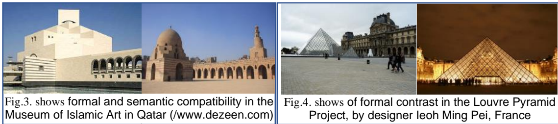
Fig.3. shows formal and semantic compatibility in the Museum of Islamic Art in Qatar (/www.dezeen.com)

by adopting glass, Fig.4, (www.archdaily.com/88705/ad-classics-le-grande-louvre-i-m-pei ).