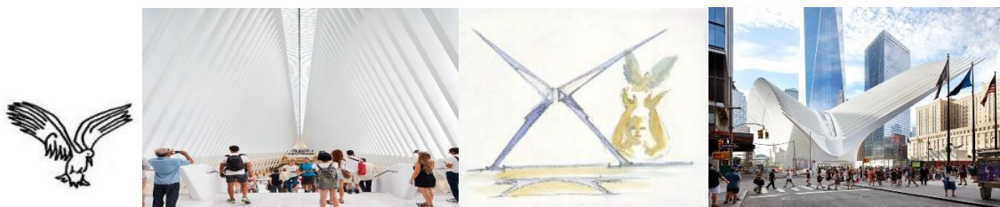
Fig.9. shows synthesis formulas in the Oculus Mass Transportation Project by Calatrava, USA, 2016

is completely different from what surrounds it. Therefore, the station represents an intermediate building that humanizes the general context of the giant towers. In addition, when a person is inside the station, he feels that it is wide and large, but when he approaches it, he feels that it is less because of the staircase system that leads you to lower levels, as the facade has a slope that appears to grow towards the ground ( www.archdaily.com ). The building is a monument to life to create a more humane environment, as it bears witness to belief that this tragedy can be overcome, "a symbol of the camaraderie of the American people and a gift to society" rather than terror and devastation. In addition to how to deal with the design of the transport hub, in addition to the inclusion of a context different from the prevailing context in the city, Fig.9. ( https://www.architecturaldigest.com/ ).