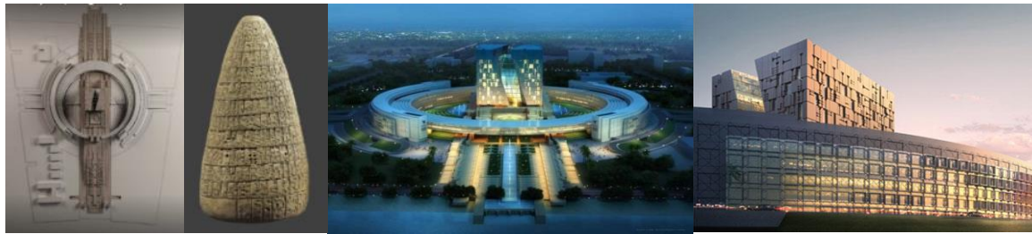
Fig.11. shows synthesis formulas in General Secretariat building of Ministers Council, Manhal Al-Haboubi, 2012.